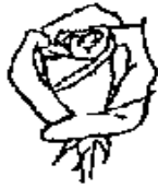
DECORATIVE \frac{1}{4} to \frac{1}{2} open