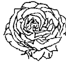
FULL OPEN BLOOM Past \frac{3}{4} open

NOTE: Large Stem = Stem must have a minimum of 4 flowers open. Stem can have more and some buds too. Small Stem = Not more than 3 flowers open